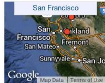
Geology and design in earthquake prone areas

Video website: http://www.windowsuniverse.org/earth/geology/movies/earthquake_testing_nsf.html